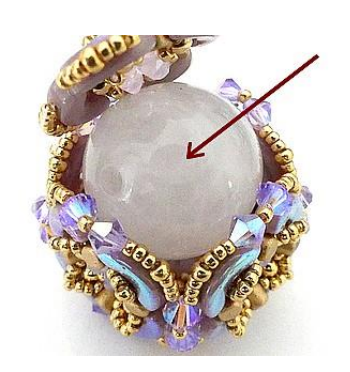
22) Make another element. 23) Exit HERE through the Place the RP20 and assemble with the B4