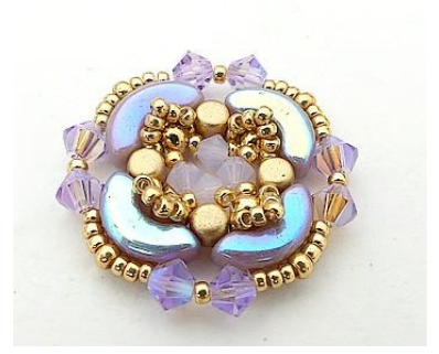
13) You'll now have this. Consolidate and stop the thread