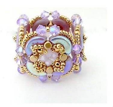
20) You'll now have this 😊