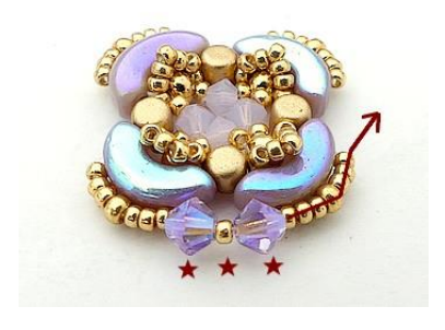
12) Pick up 1 B4, 1 SB15, 1 B4 through the next rocailles. All over the row