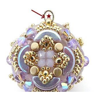
27) Place the ring in SB8. You have finished The D'Cybèle pearl can be a pendant, a bag jewel etc.