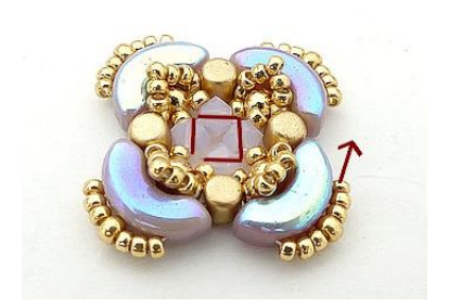
11) Pass through the 4 B3 and consolidate. Exit like picture HERE through the rocailles