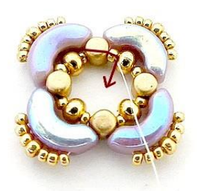
6) You'll now have this. Exit like picture HERE through the SB15