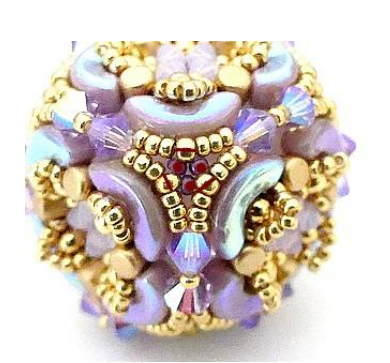
25) Repeat step 25 twice. We have 3 SB15. Repeat steps 24 and 25 for all corners