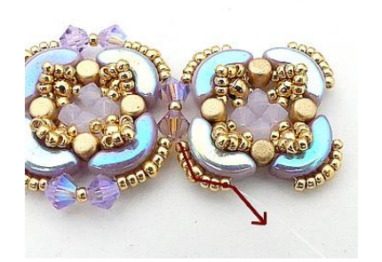
16) Exit HERE through the rocailles