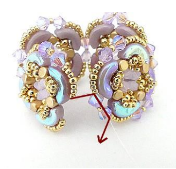
19) Assemble as in step 15