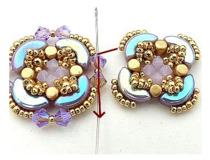
15) Assemble the first element to the second with the help of the 2 B4