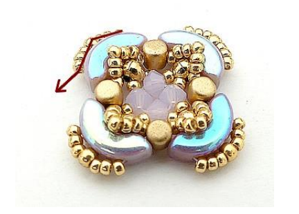
14) Make another element. Repeat steps 1 to 11