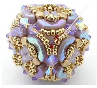
24) Pick up 1 SB15 (color 2) through the SB11