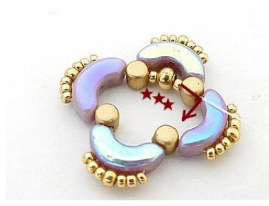
5) Pick up between Minos, 1 SB15, 1 SB8, 1 SB15. All over the row