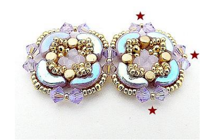
17) Continue the round following step 12 and stop the thread