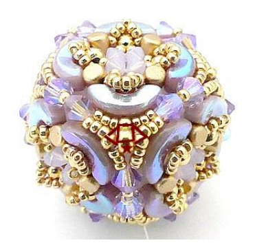
26) Except for the last corner, enter 1 SB8 passing through the three SB11.