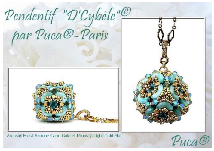
Another color 😊

I wish you a happy beading. I offer you this pattern.