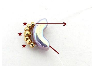
1) Pick up 1 Arcos, 3 SB15, 1 SB11, 3 SB15 and exit like picture