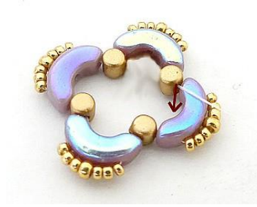
4) Repeat steps 2 and 3. Close. Exit through the Minos